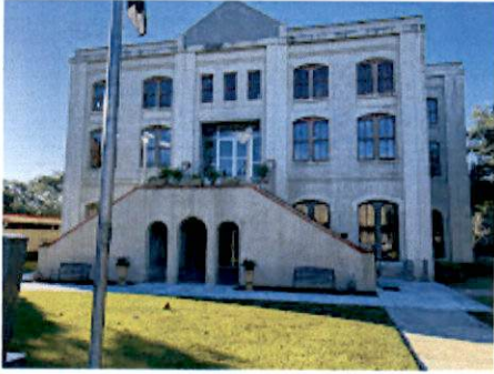
front of the courthouse.jpg 3427K