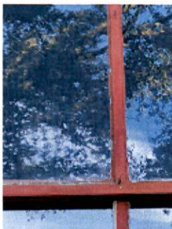
Hooks in the Windows.jpg 2625K