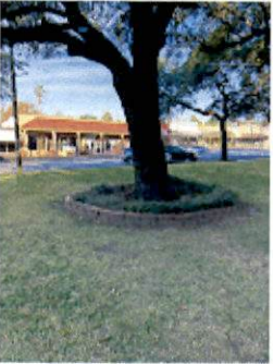
27 Trees.jpg 6257K